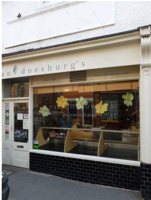
Van Doesburg's – delicatessen & catering