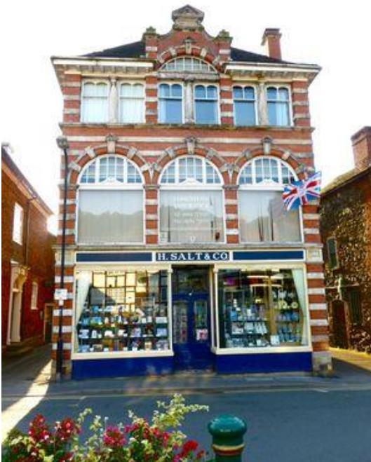
H Salt & Co – hardware, gifts, cards, fudge