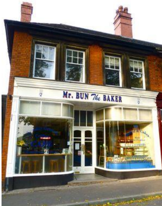
Mr Bun the Baker – café, bread and cakes