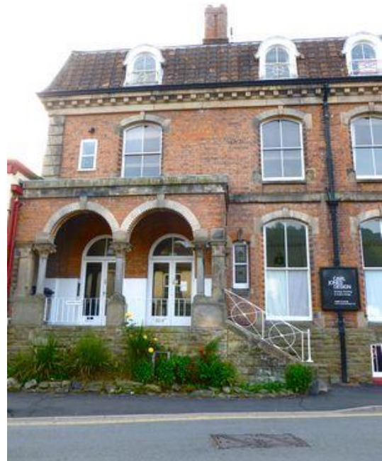
Carl Jones Design – graphic design