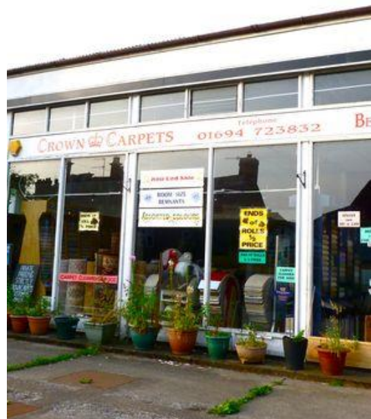
Crown Carpets – floor coverings