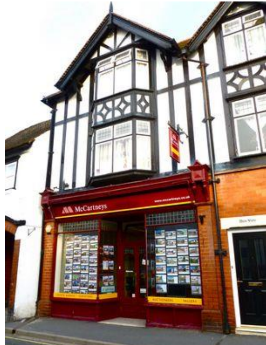
McCartneys – Estate Agents