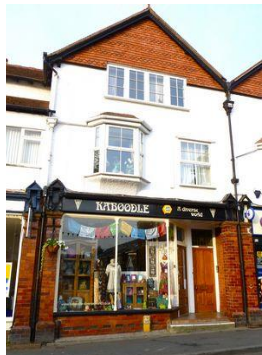
Kaboodle – Gifts and Clothes