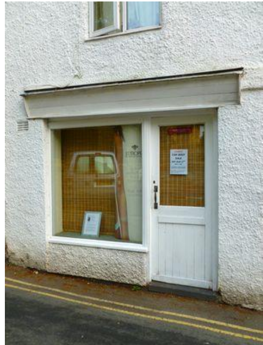
Health & Beauty Clinic – facials, nails and tanning