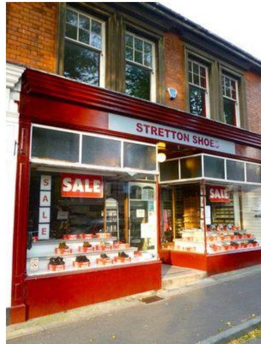
Stretton shoes – shoe shop