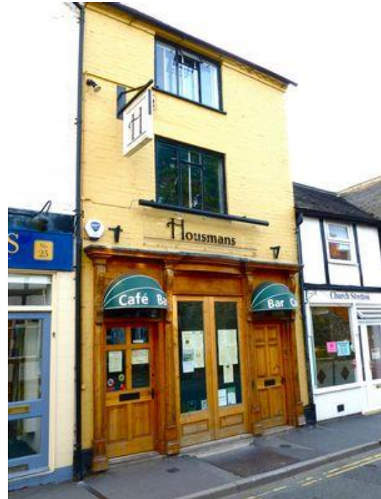
Housmans – wine bar & tapas