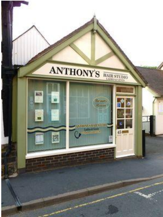
Anthony's – hair studio