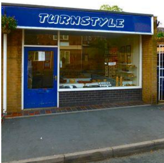
Turnstyle – woodcarving & jewelry