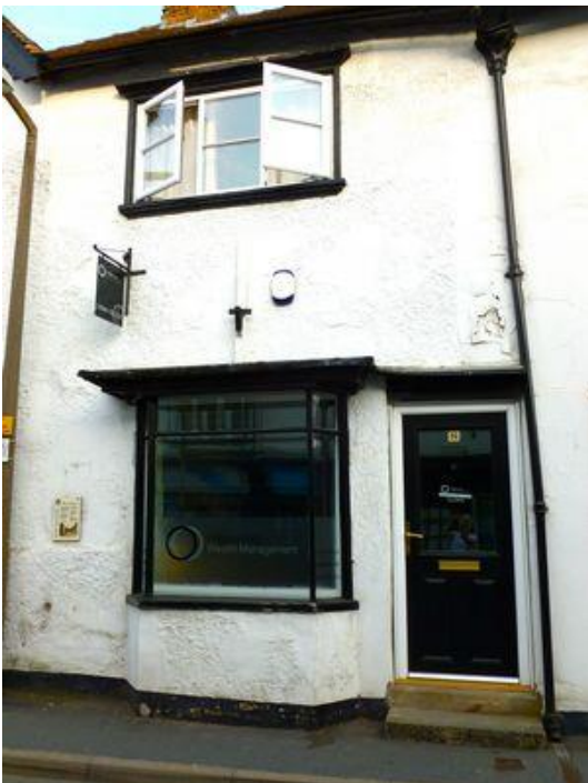
Wealth Management – Financial Advisor