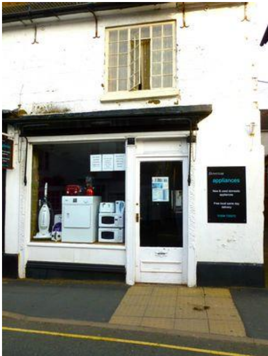
Stretton Appliances – new and used domestic appliances