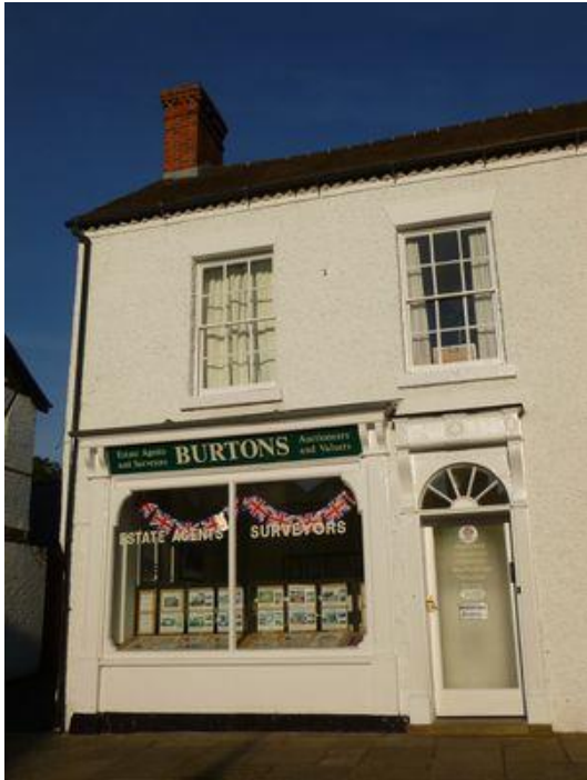
Burtons – Estate Agents & Surveyors