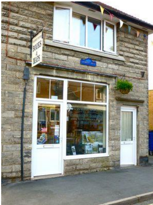
Burway Books – books and maps