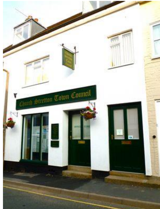
Church Stretton Town Council - offices