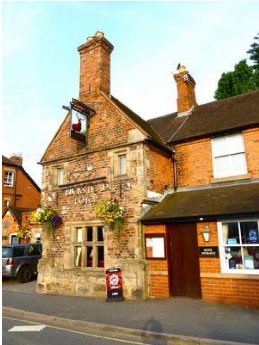
High Street West side