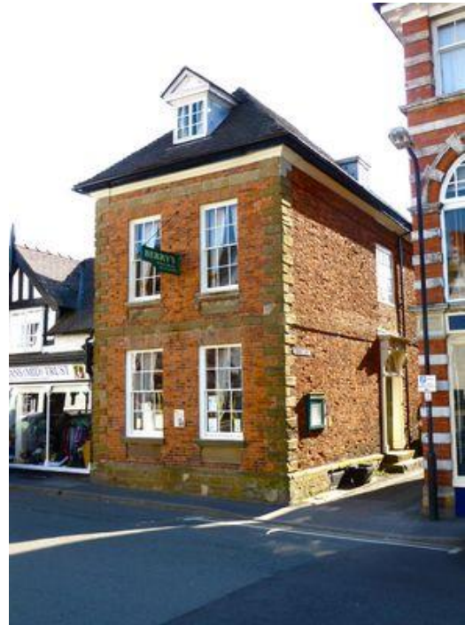
Berry's – Café