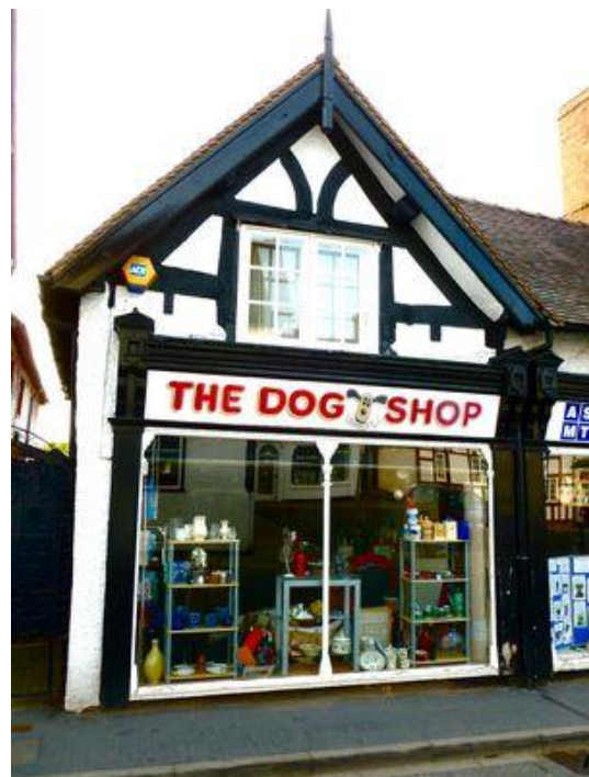
The Dog Shop – Charity Shop