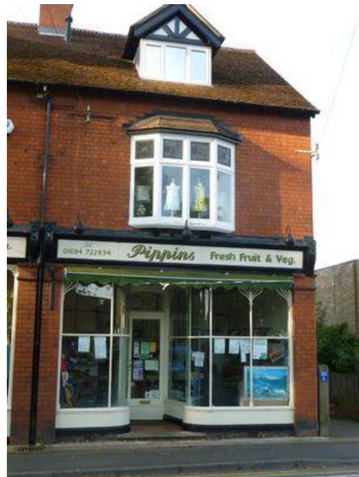
Pippins – fruit & vegetables