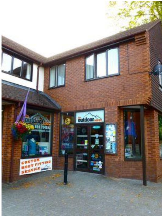
The Outdoor Depot – outdoor clothing