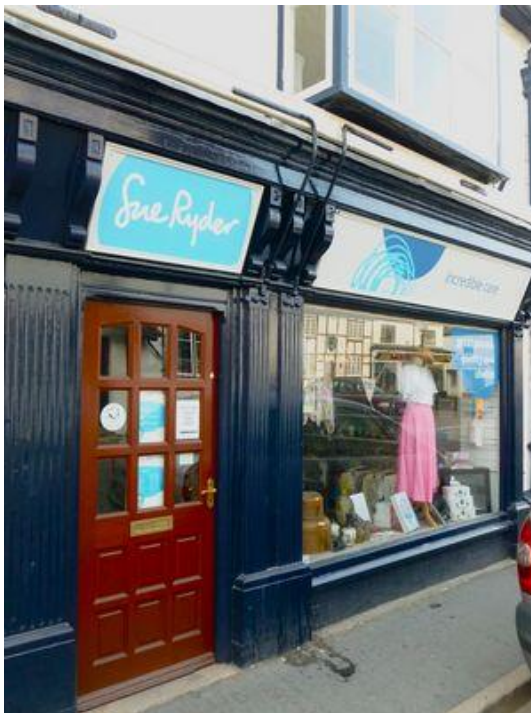
Sue Ryder – Charity Shop