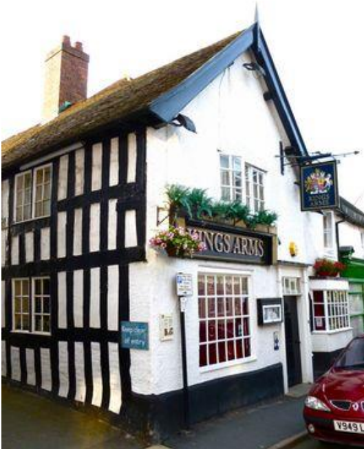
Kings Arms – Public House