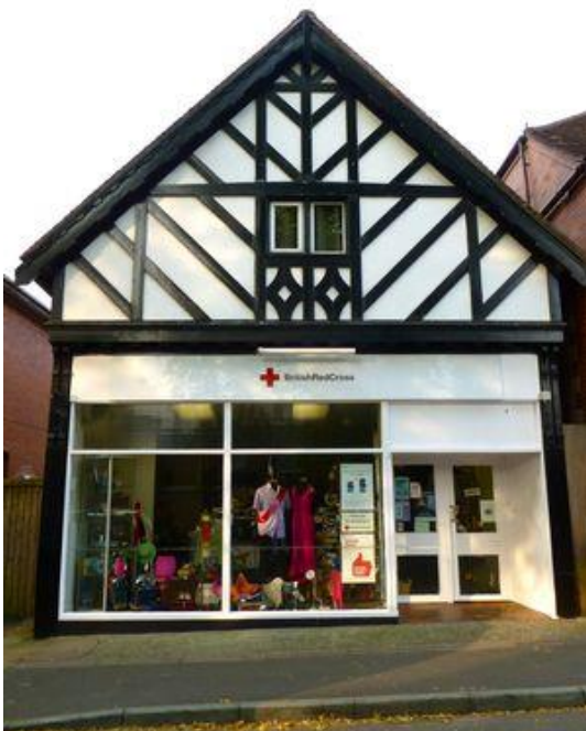
British Red Cross – Charity Shop