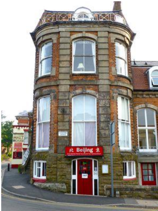
Beijing – Chinese Restaurant