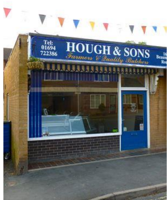
Hough & Sons - Butchers