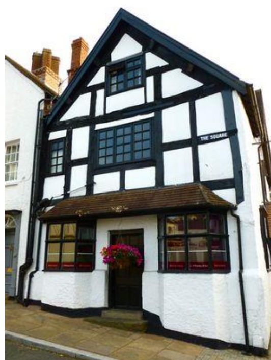
L V Priestley & Son - Solicitors