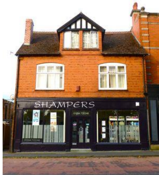
Shampers - Hairdressers