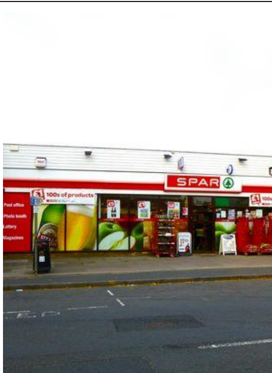
SPAR – Supermarket and Post Office