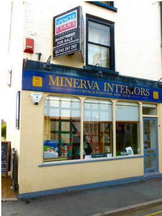
Minerva Interiors – soft furnishings