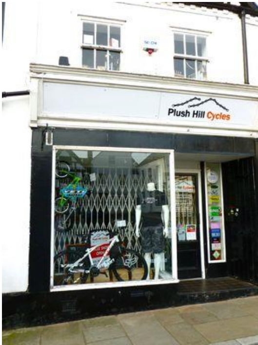
Plush Hill Cycles – cycle shop