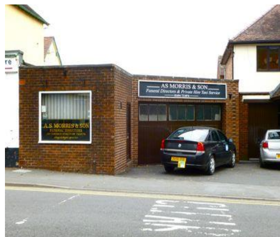
A S Morris & Son – Funeral Director & Taxis