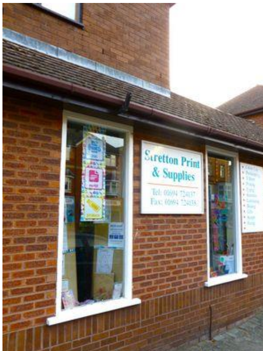
Stretton Print & Supplies – office materials