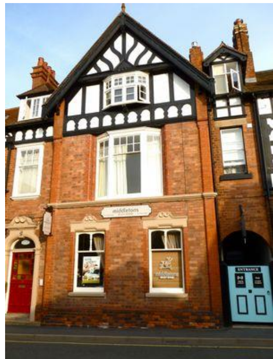
Victoria House – Bed & Breakfast Jemima's Kitchen – Café