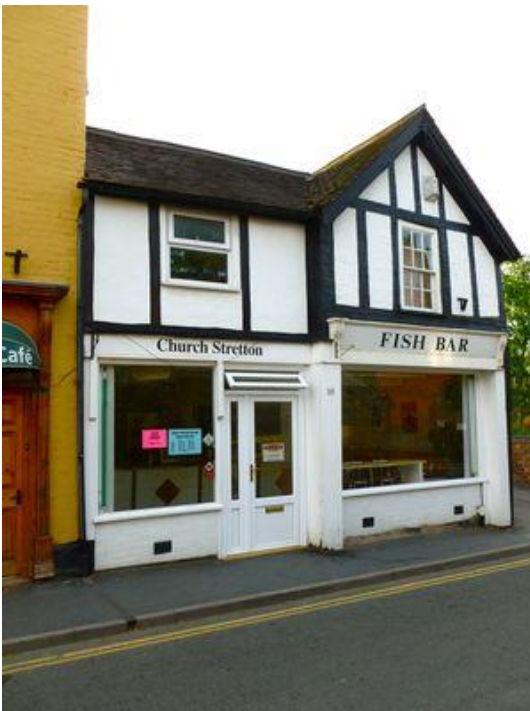
Church Stretton Fish Bar