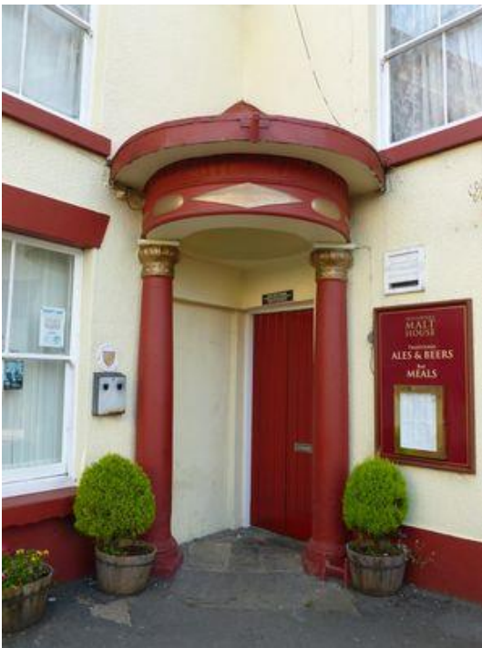
Malt House – Public House