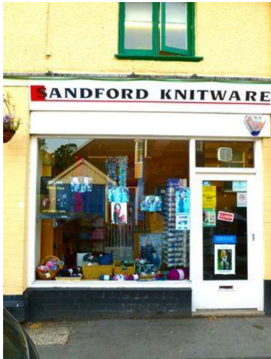
Sandford Knitware – knitting & sewing supplies