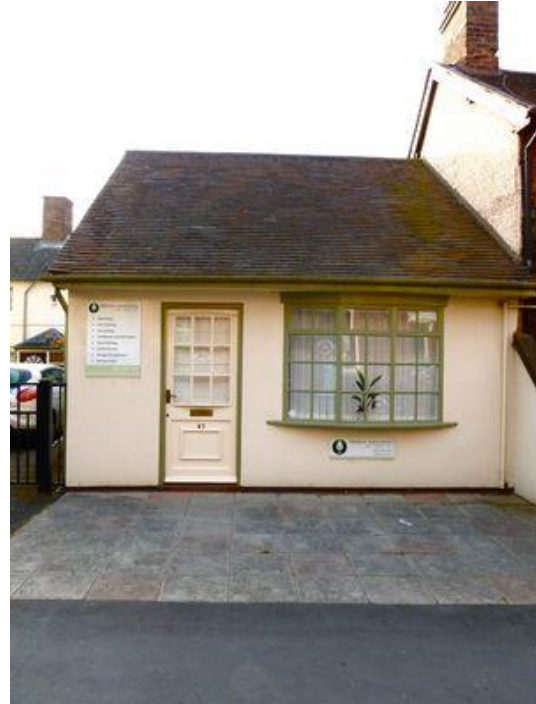
Peridot Associates – personal & organisation development