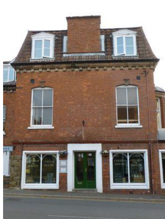
Ginger & Green – Café