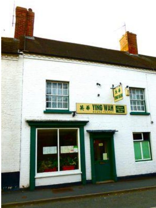
Ying Wah – Chinese take-away