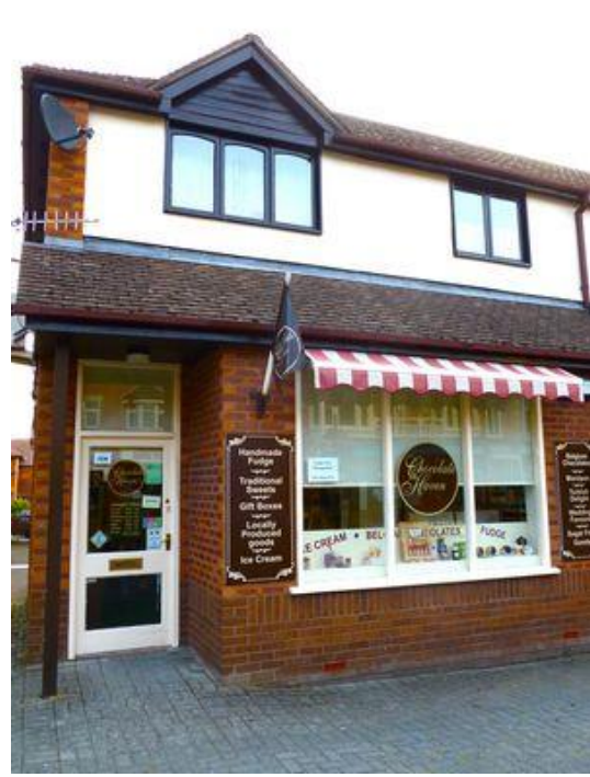
Chocolate Haven – sweets and ice creams