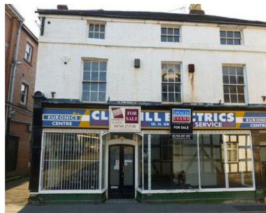
Clee Hill Electrics (for sale)