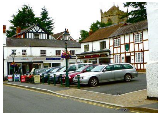
A Snapshot of the Town's Commercial Premises in Summer 2013