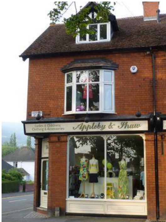
Appleby & Shaw – ladies' & childrens' clothes