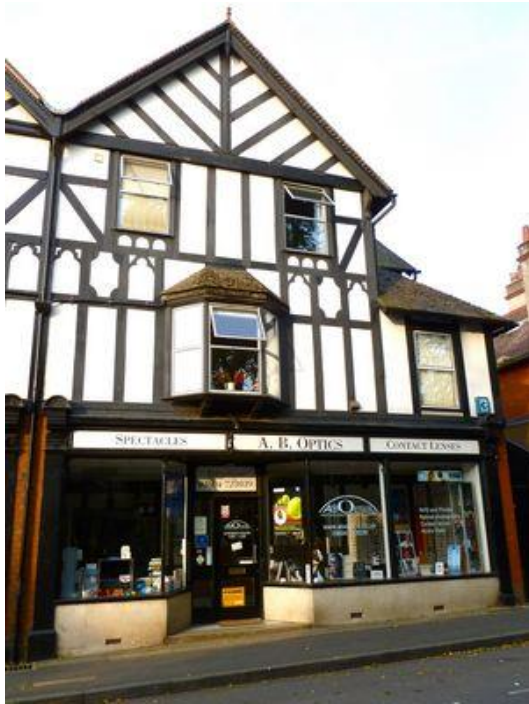
A B Optics – Opticians