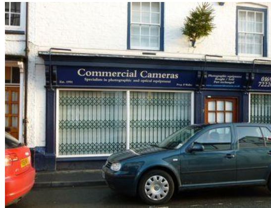
Commercial Cameras – photographic & optical equipment