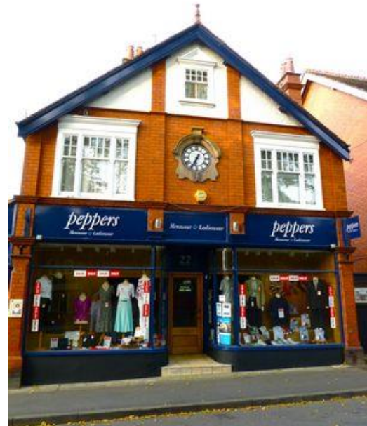
Peppers – ladies & gents outfitters