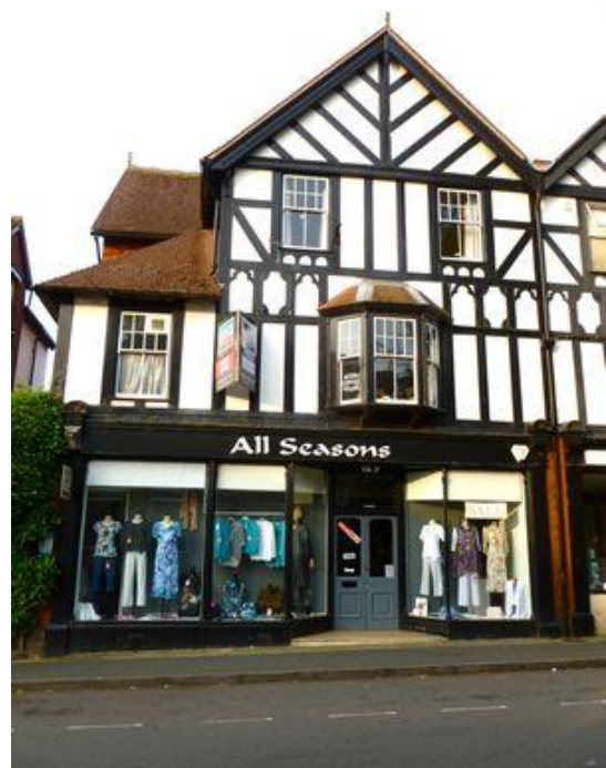
All Seasons – ladies & gents clothing