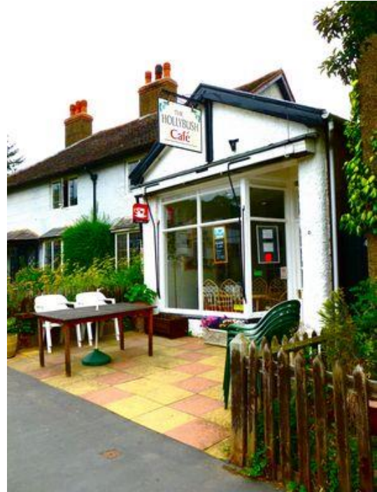
The Hollybush Café