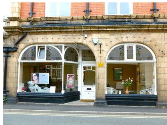
The Amber Room – hair salon