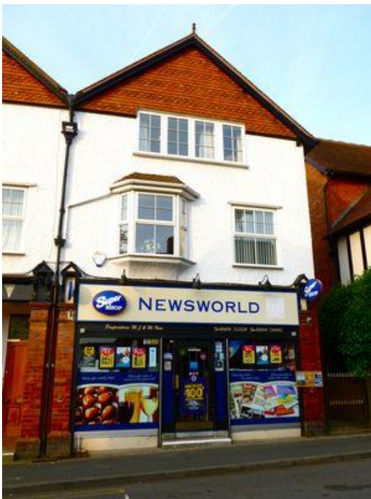
Newsworld - Newsagents