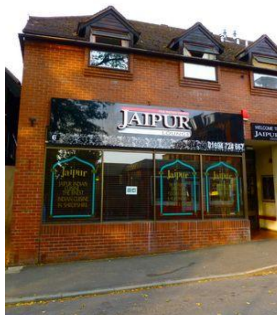
Jaipur – Indian restaurant and take-away