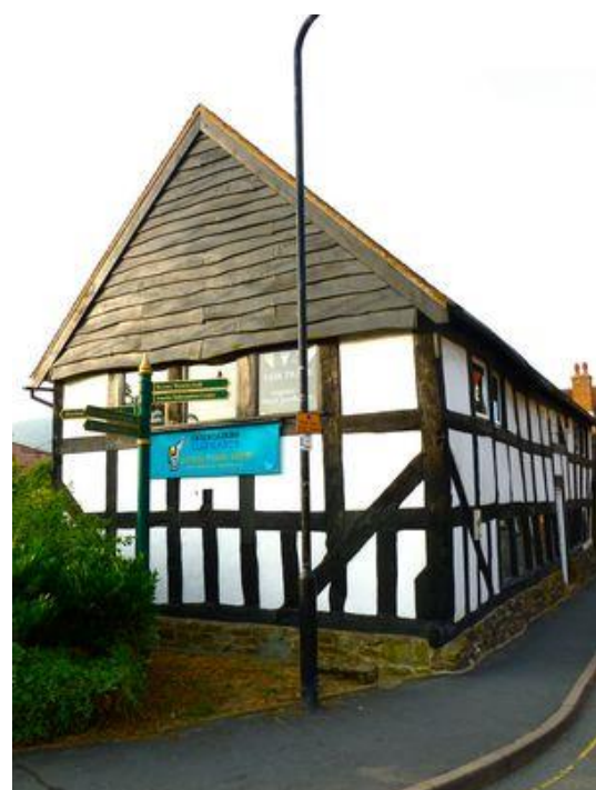
Entertaining Elephants – speciality goods & foods