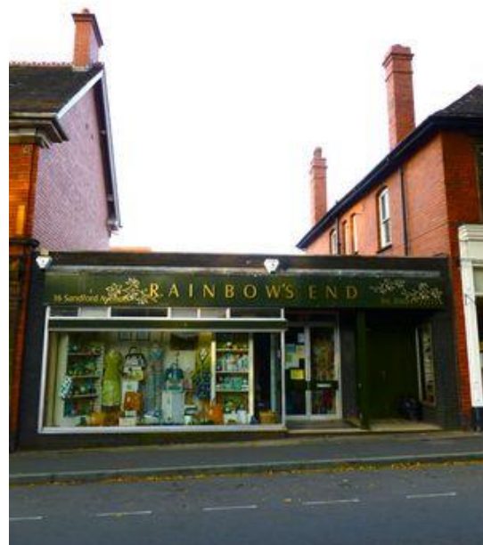
Rainbow's End – gifts, clothes and cards