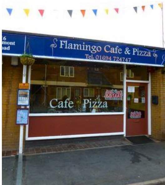
Flamingo Café & Pizza