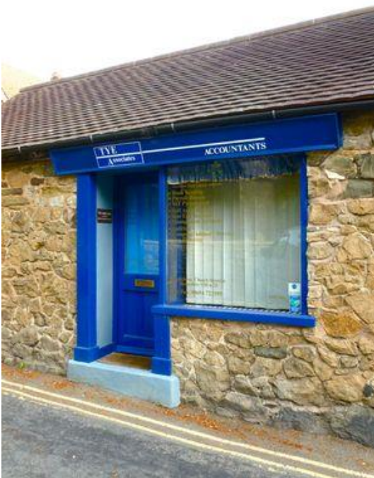
Tye Associates - Accountants