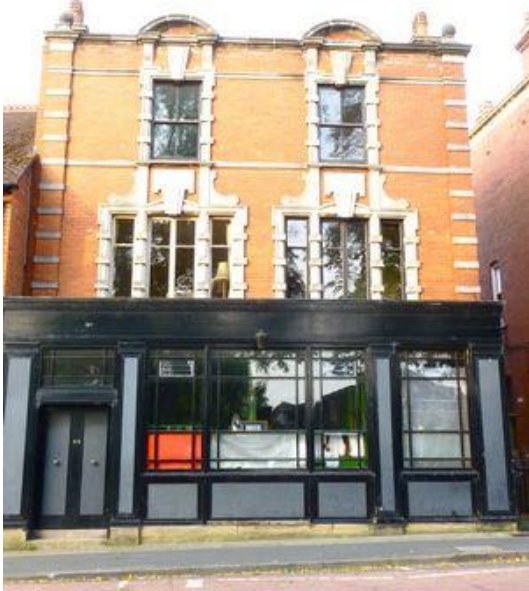
Sandford Avenue West of A49, South side