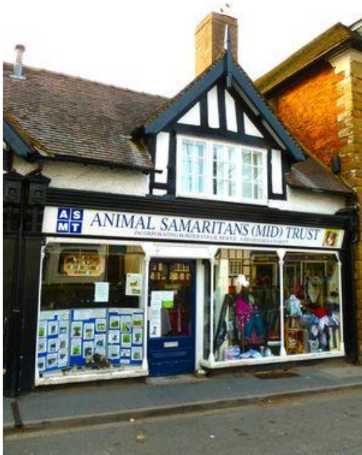
Animal Samaritans (Mid) Trust – Charity Shop