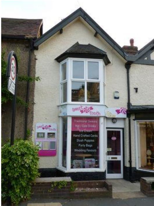
Sweet Tooth – confectionary