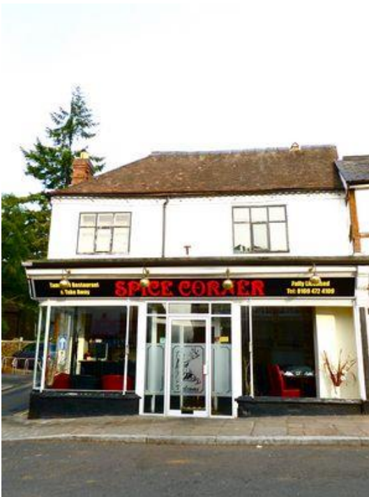
Spice Corner – Indian restaurant