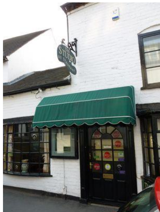
The Studio - Restaurant